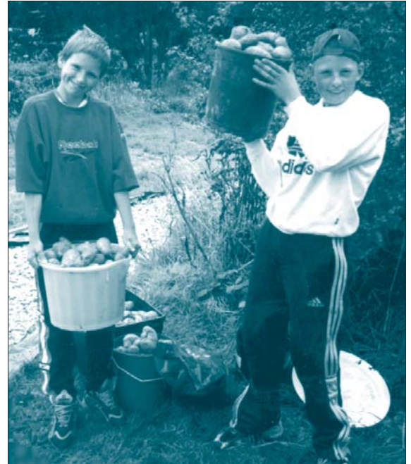
Potato harvest. Kids do not always spell trouble!

Please note: Allotment associations will need to consult their allotment authority before adopting any of the measures suggested in this factsheet.