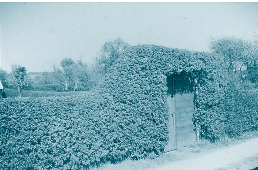
A hedge, once mature, is the most secure and attractive perimeter boundary – this privet hedge on a Coventry site is 100 years old.