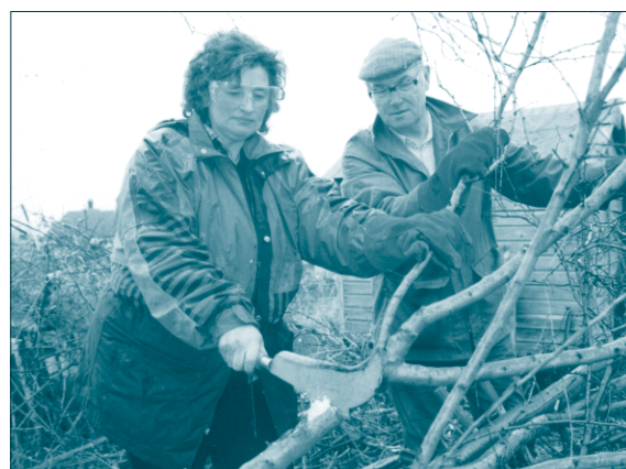
Volunteers lay a hedge at Welbeck Road, Derbyshire