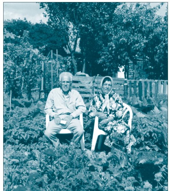
Most of the time allotments are havens of peace in an otherwise busy world

See ARI's information pack A guide to fundraising for allotment associations .